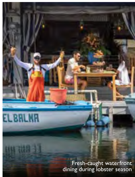
Fresh-caught waterfront dining during lobster season

Good to Know: The square connects to Sunset Pier to the right, with fantastic live music and amazing frozen cocktails