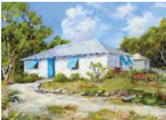
A Rose Adderly House