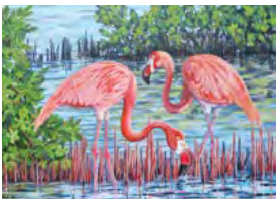
Jaynie Zenisek Island Snowbirds