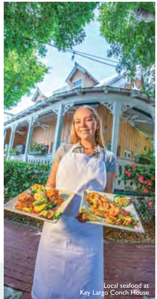
Local seafood at Key Largo Conch House