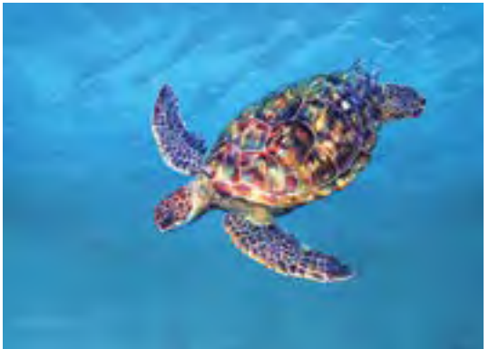
Mary Blackman Sea Turtle