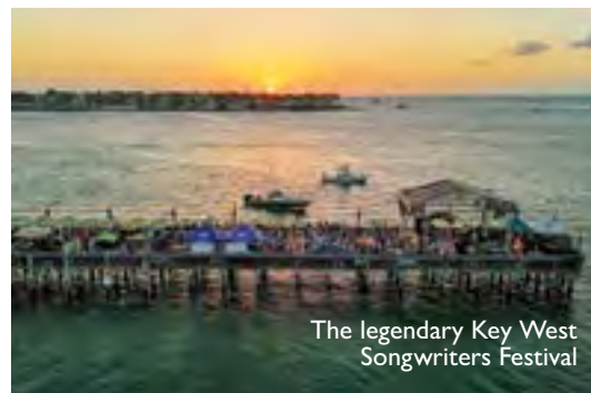
The legendary Key West Songwriters Festival