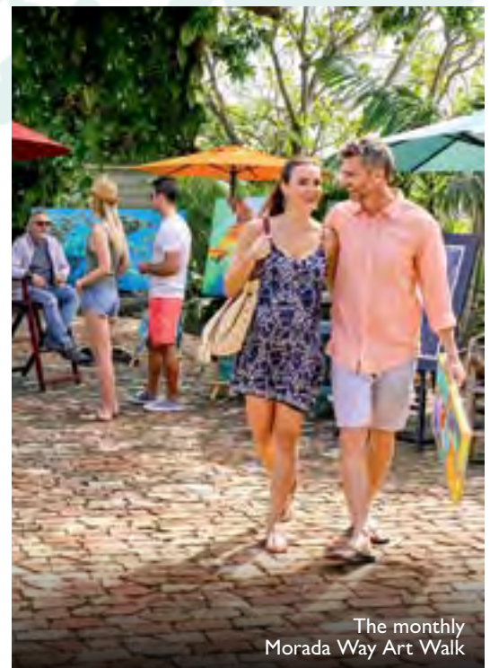
The monthly Morada Way Art Walk