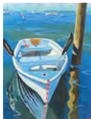
Deborah Spencer Untitled