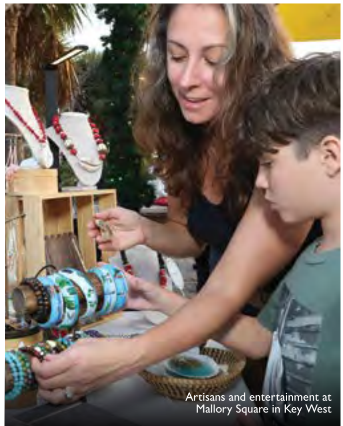
Artisans and entertainment at Mallory Square in Key West

At the end of the road, Key West delivers The Keys' most dynamic and diverse market experiences. The Truman Waterfront Farmers Market, held Thursdays year-round, is a vibrant late-afternoon gathering where dozens of vendors serve up tropical fruit juices, gourmet cheeses, small-batch body care, boozy ice pops and international cuisine — all set against sweeping waterfront views and breathtaking sunsets. Visitors often make a day of it, picnicking in the scenic park, cooling off at the free splash pad or exploring the US Coast Guard Cutter Museum. On Sundays during season, the Key West Artisan Market sets up near Higgs Beach with a thoughtfully curated lineup of Keys-based makers. Each week brings a fresh theme — eco-living, island culture, local nonprofits — with stalls offering everything from sea glass jewelry to locally roasted coffee.