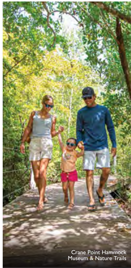
Crane Point Hammock Museum & Nature Trails