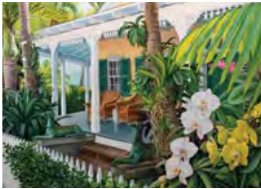
Lynne Fischer Southard Street Gingerbread